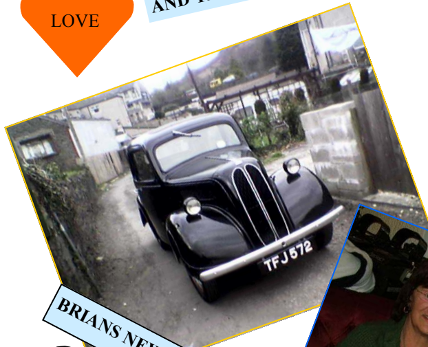
BRIANS NEW POP