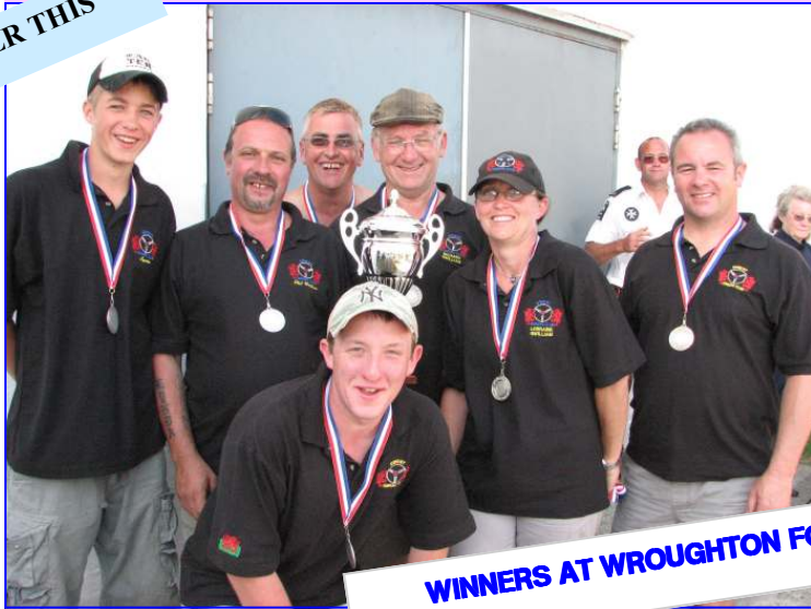
WINNERS AT WROUGHTON FOR 2008