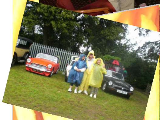
WHO REMEMBERS RAIN, RAIN. RAIN & MORE RAIN