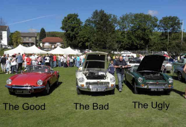
The Good The Bad The Ugly